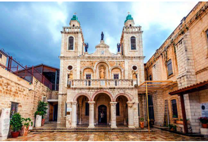
WEDDING CHURCH CANA