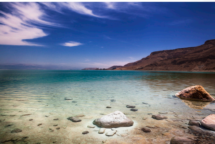
THE DEAD SEA