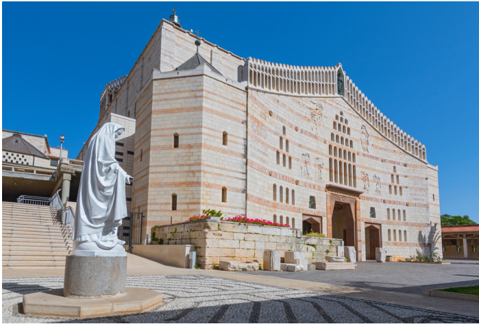
ANNUNCIATION CHURCH NAZARETH